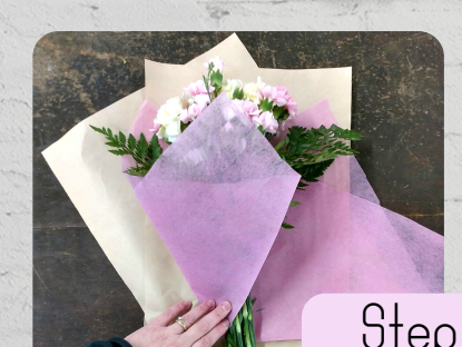
Step 4: wrap each side of the tissue over at a slight v