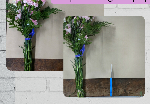
Step 3: set your bouquet in the middle, 2/3 down