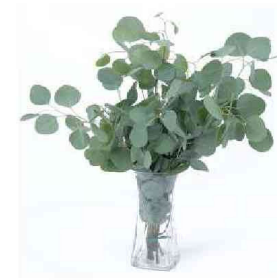
Silver Dollar Euc. blue green foliage 2-3" round leaves