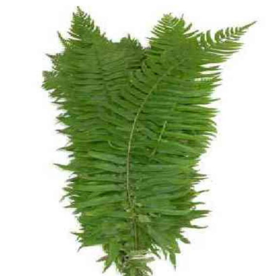
Brake Fern large sword-like fern with soft yet rigid fronds