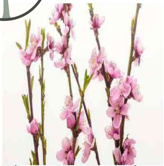
Blooming Branches many varieties avail. seasonally