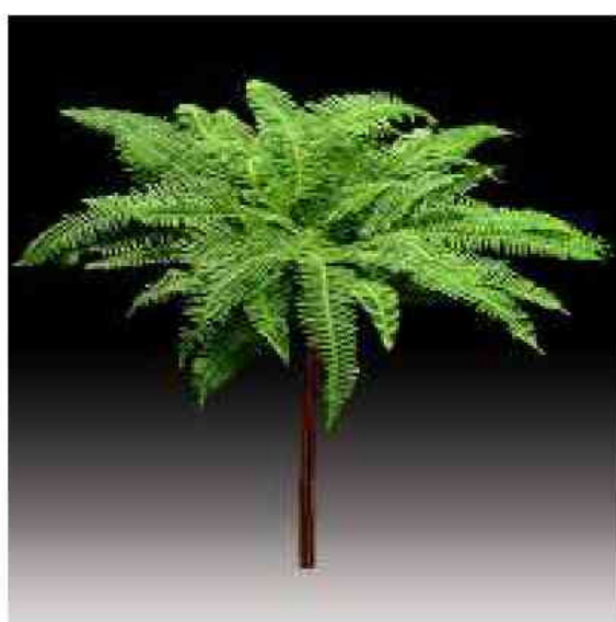
Umbrella Fern umbrella like shape fronds, 35 cm diameter