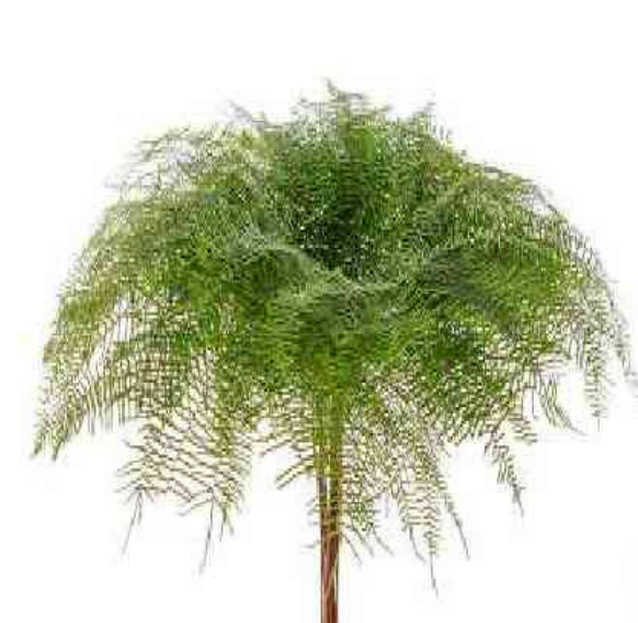
Sea Star australian fern, rougher texture than umbrella fern