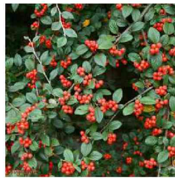
Cotoneaster dark green textured leaves with red berries