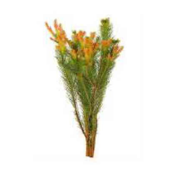
Grevellia soft green foliage with red/orange tips