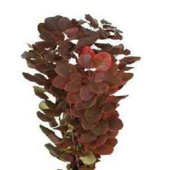
Cotinus smokebush, in burgundy or green. often with plume