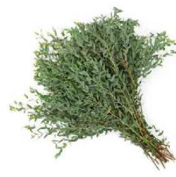
Gunii Euc. soft, blue green foliage. small oval leaves