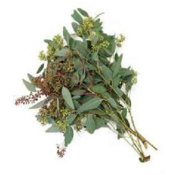
Seeded Eucalyptus used often in wedding florals. blue green with berries