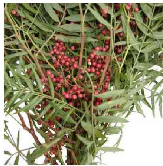
Pepperberry fragrant foliage with red berries, slightly hanging