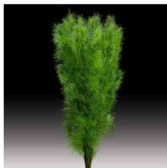
Koala Fern fluffy, feather like foliage. long lasting