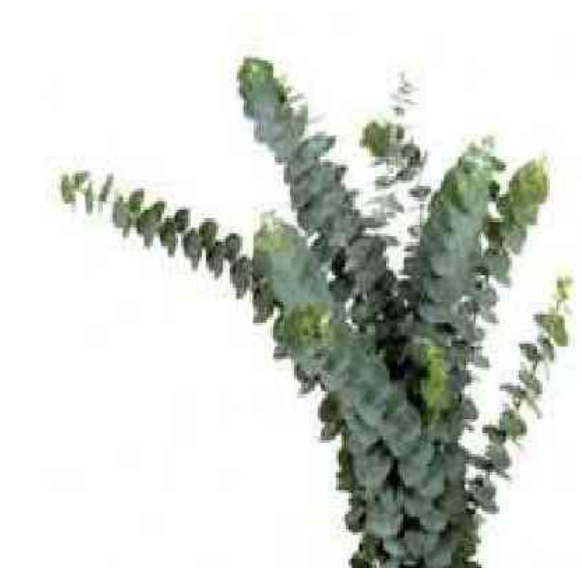
Baby Blue Eucalyptus round leaves on rigid stems