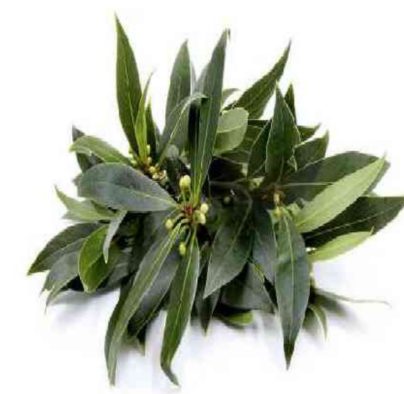
Bay Leaf fragrant foliage often with berries