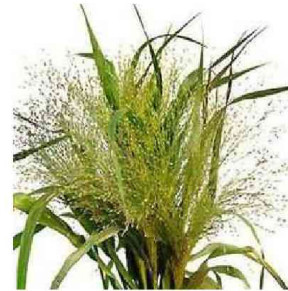
Explosion Grass grassy-like foliage with long tendrils of flowers