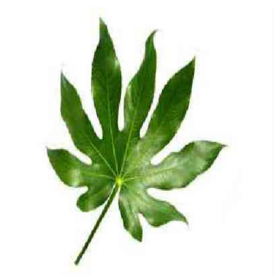
Aralia bright green tropical-like leaves.