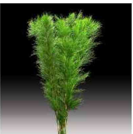
Dingo Fern vibrant green, fluffy texture