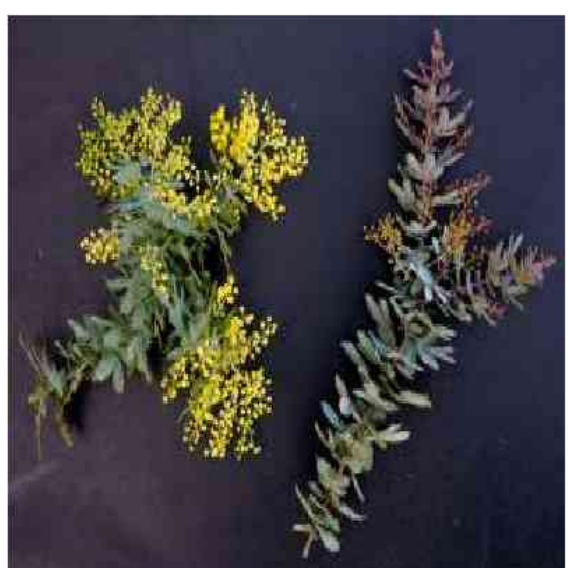
Acacia blue green leaves with purple hue