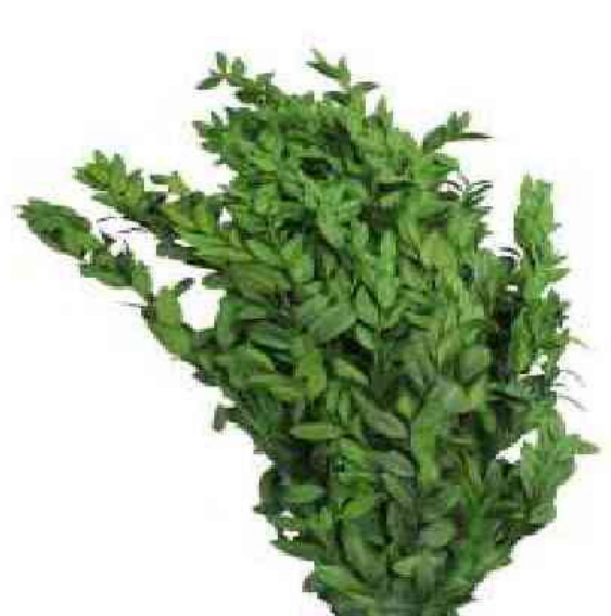
Boxwood smal, bright green leaves