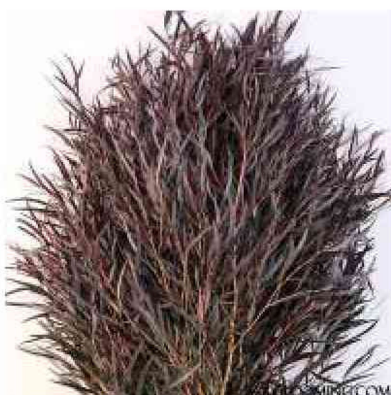
Agonis burgundy, thin and airy foliage