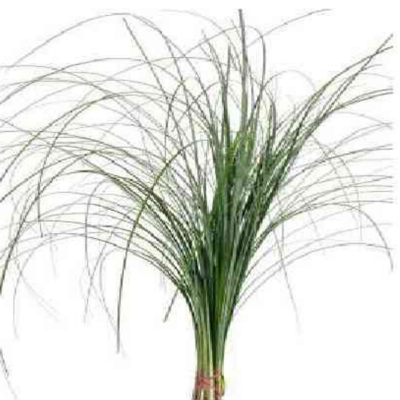
Bear Grass thin blades that come to a slight curve