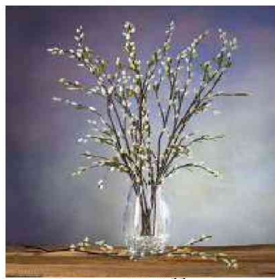
Pussy Willow avail. seasonally