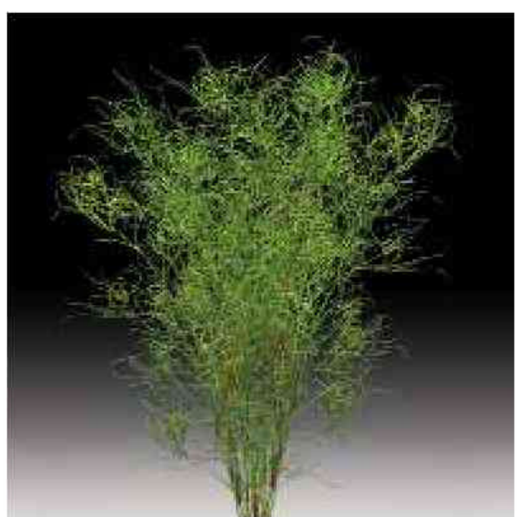
Goana Claw long straight stems, with claw like curls