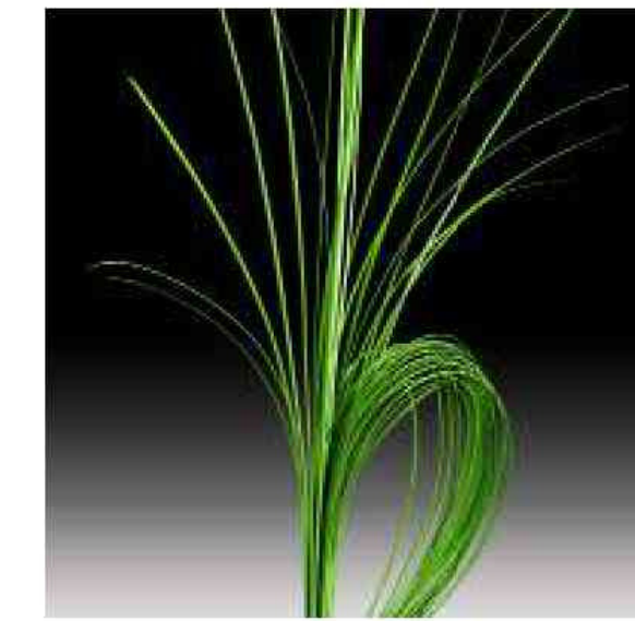
Flexigrass thin, flexible long foliage. bright green, long lasting

*Some Greens require 2 weeks' notice to special order. Please call in to inquire what's in stock! 707-525-0780