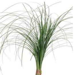
Bear Grass thin blades that come to a slight curve