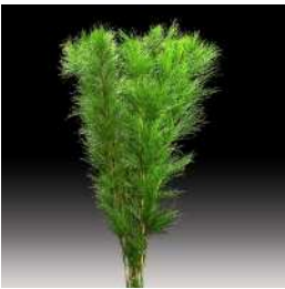
Dingo Fern vibrant green, fluffy texture