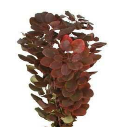
Cotinus smokebush, in burgundy or green. often with plume