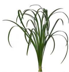
Lily Grass available bright green or variegated, long flexible leaves