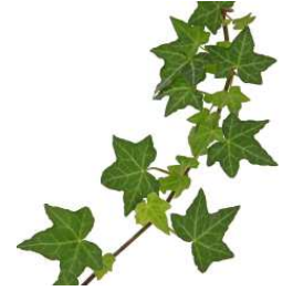
Ivy avail. hanging or bush. hanging is small needle-like, bush ivy is larger