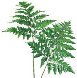
Leather Leaf traditional fern foliage used in many forms, bright green