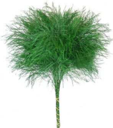
Ming Fern Soft and airy fern, bright green