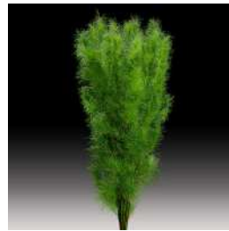
Koala Fern fluffy, feather like foliage. long lasting