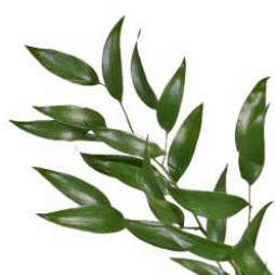
Italian Ruscus Thinner oval dark green leaves on a long stem