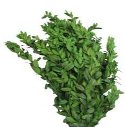
Boxwood small, bright green leaves