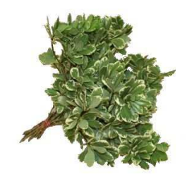
Pittosporum avail. variegated or bright green, med. size oval leaves on wide branched stems