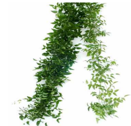
Smilax sold in long garand type bunches, small green leaves