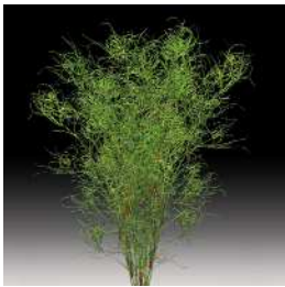
Goana Claw long straight stems, with claw like curls