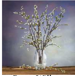
Pussy Willow avail. seasonally