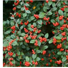
Cotoneaster dark green textured leaves with red berries