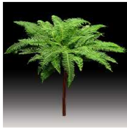
Umbrella Fern umbrella like shape fronds, 35 cm diameter