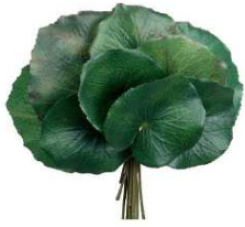
Galax small round dark green leaves