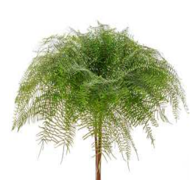
Sea Star australian fern, rougher texture than umbrella fern