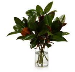
Magnolia Large, shiny dark green leaves, backside is fuzzy brown.