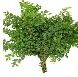
Huckleberry bright green or red round leaves on wide branched stems