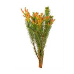
Grevillia soft green foliage with red/orange tips