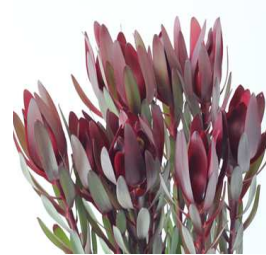
Leucadendron multiple color options, popular red "safari sunset" variety