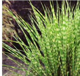
Zebra Grass long straight grass blades in a striped color pattern, green and white or yellow

*Some Greens require 2 weeks' notice to special order. Please call in to inquire what's in stock! 707-525-0780