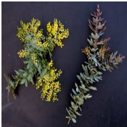
Acacia blue green leaves with purple hue