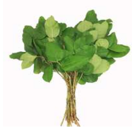
Lemon Leaf larger, bright green oval leaves on wide branched stems