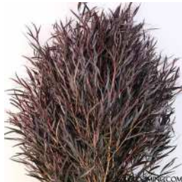
Agonis burgundy, thin and airy foliage