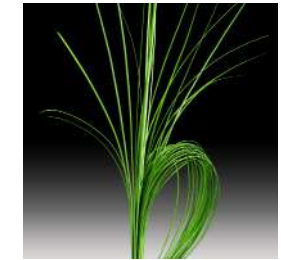
Flexigrass thin, flexible long foliage. bright green, long lasting

*Some Greens require 2 weeks' notice to special order. Please call in to inquire what's in stock! 707-525-0780