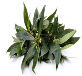
Bay Leaf fragrant foliage often with berries