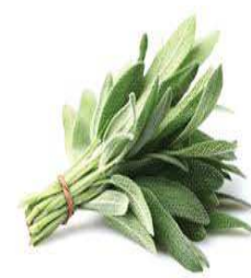
Sage short bunches, soft grey green hairy leaves, fragrant