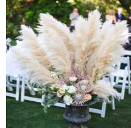
Pampass Grass Long branches with large ivory feather-like plume