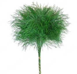
Tree Fern tall straight stems with plume of green fern foliage at top