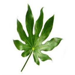
Aralia bright green tropical-like leaves.