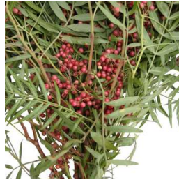
Pepperberry fragrant foliage with red berries, slightly hanging