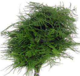
Plumosa Long feathery fern, with some spikey texture