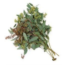
Seeded Eucalyptus used often in wedding florals. blue green with berries