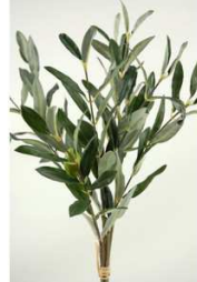
Olive Grey green oval leaves on greyish stem, tall or short avail.