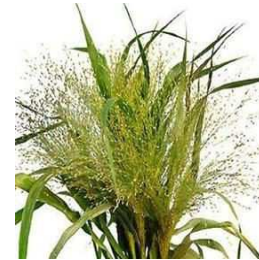
Explosion Grass grassy-like foliage with long tendrils of flowers