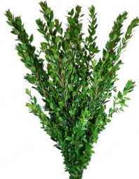
Myrtle Bright green oval leaves with slight point, along a very straight stem