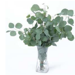
Silver Dollar Euc. blue green foliage 2-3" round leaves