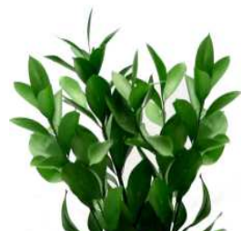
Ruscus Large bright green leaves good for weddings and corsages