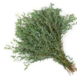
Gunii Euc. soft, blue green foliage. small oval leaves