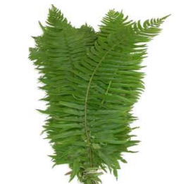
Brake Fern large sword-like fern with soft yet rigid fronds