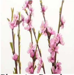
Blooming Branches many varieties avail. seasonally