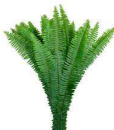
Sword Fern soft and straight fern foliage in sword shape