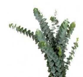
Baby Blue Eucalyptus round leaves on rigid stems