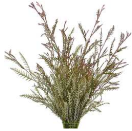
Grevillea varied green to red toothed foliage, tall and upright